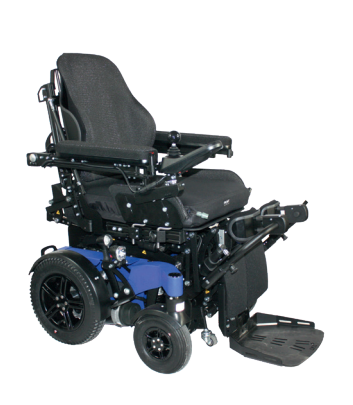
COMFORT POSITION (SITTING)