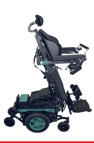
INCLINED STANDING (APPROX. 67°)